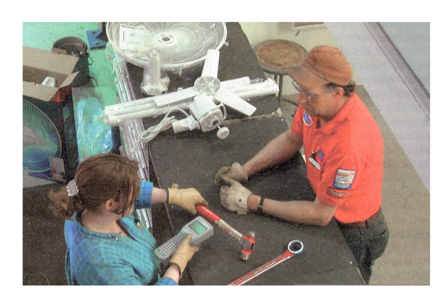
Figure B-2: Barcode identification and tracking of tools

One consideration to keep in mind when developing such a system: the next generation of technology, already under development, will replace the barcodes with inexpensive microchips that can be read from a distance with electronic scanners. This technology is already being deployed for retail stores and supermarket checkouts in the US.