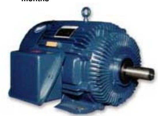
Figure B-3: Recommendations for Electric Motor Storage