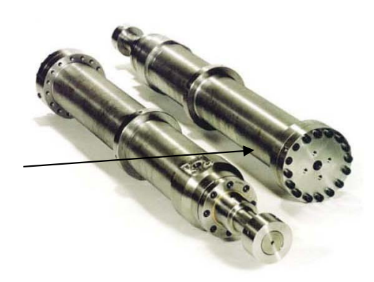
Figure B-4: Side or crosshead cylinders. After inspection, store in a vertical position to avoid any load on packing, and coat the inside and machined surfaces with oil.

Store spare press tools in a warm place, to minimize preheat time and avoid thermal shock.